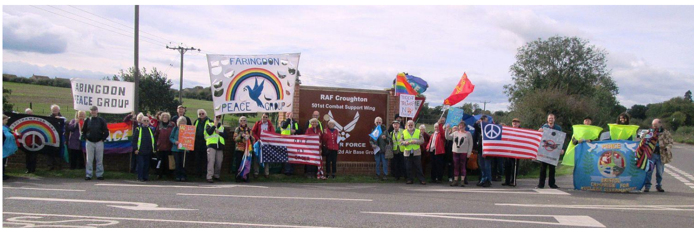
Protest at Croughton during "Keep Space for Peace Week"

The Friends Meeting House is at 43 St Giles', Oxford OX1 3LW - a 20 min walk from Oxford Railway Station.